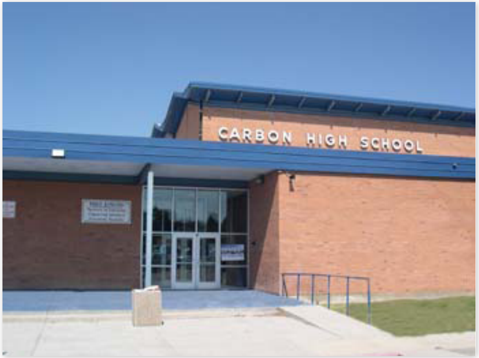
Carbon High School located in Price, Utah.