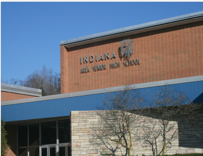
Indiana Area Senior High School, Indiana, PA.