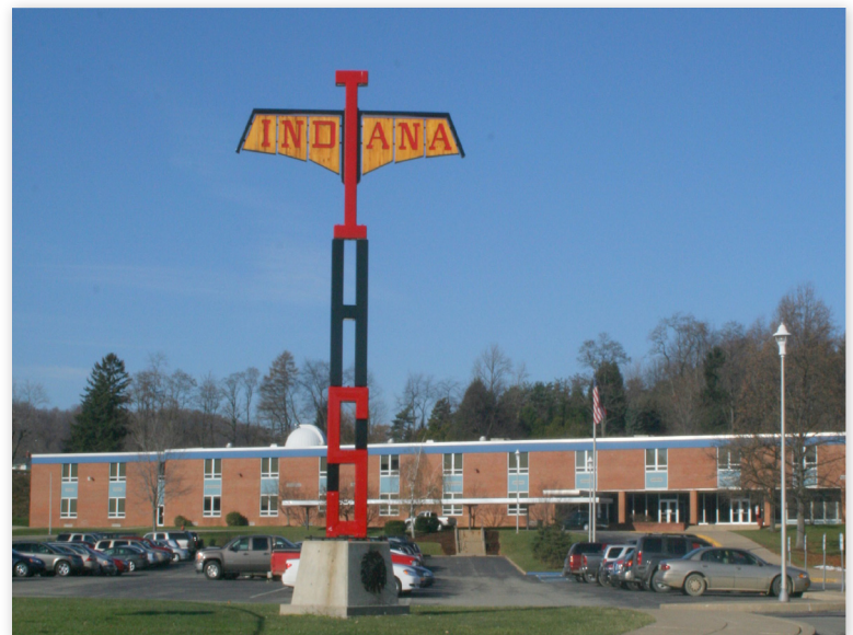
Indiana Area Senior High School, Indiana, PA.

Result: Self-paced participation led to the retention of 13 of 13 “high-risk” students and increased their GPAs from a failing average to a C average in just one school year.