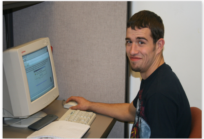
A student works with A+LS at Indiana Area Senior High School.

The district installed A+LS at the beginning of the 2007 school year. They chose A+LS because it provided them with the ability to individualize curriculum for every student. They were also keen to find a package that provided the flexibility to align content with Indiana’s own district-approved content. “ A+LS had the courses that we wanted and different levels of content that we needed,” he stated. “It also had a unique framework that gave us the flexibility to include multiple choice, short answer, fill-in-the-blank, and essay questions in our lessons.”